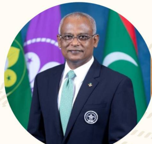
H.E.P. Ibrahim Mohamed Solih President from 17th Feb 2018 to Present Day