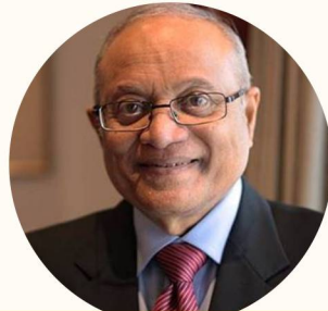
H.E. Maumoon Abdul Gayoom President from 11th Nov 1978 to 10th Nov 2008