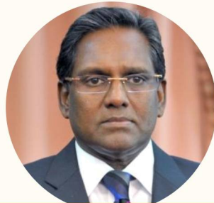
Dr. Mohamed Waheed Hassan President from 07th Feb 2012 to 16th Nov 2013