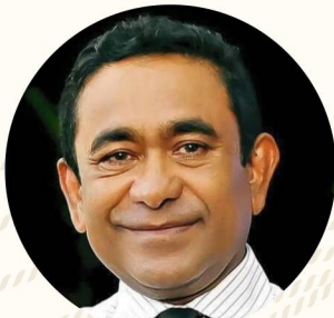
H.E. Abdulla Yameen Abdul Gayoom President from 17th Nov 2013 to 16th Nov 2018