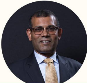
H.E. Mohamed Nasheed President from 11th Nov 2008 to 7th Nov 2012